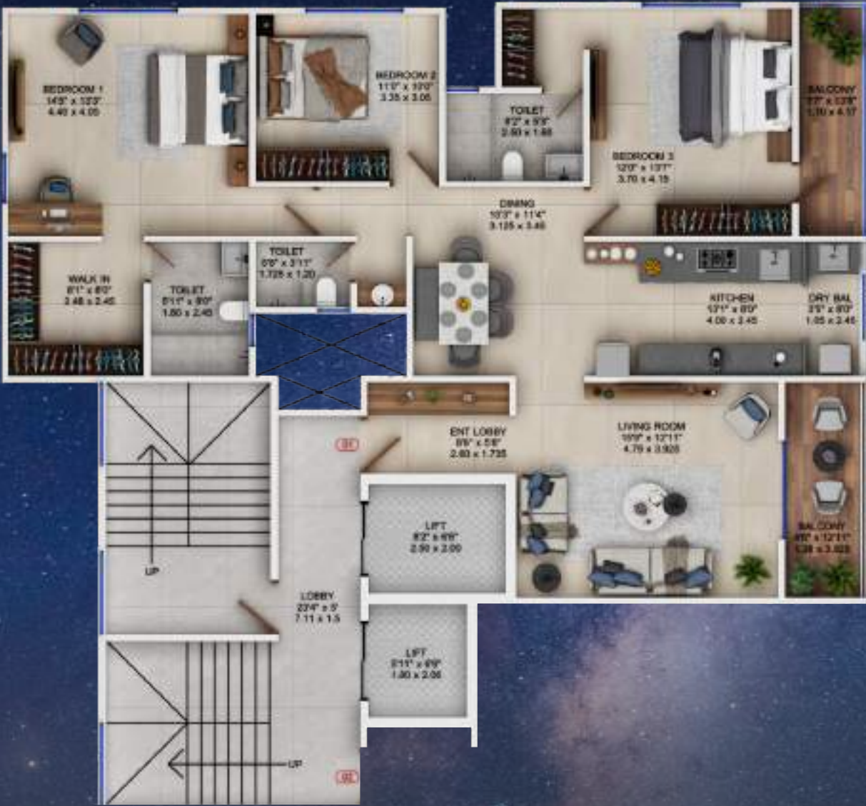
RERA CARPET AREA STATEMENT (SQ.FT)