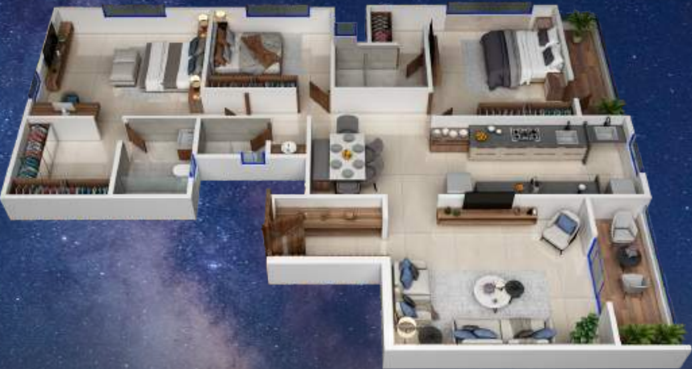
RERA CARPET AREA STATEMENT (SQ.FT)